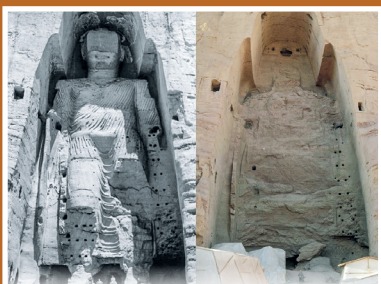
The niche of the taller colossal Buddha, before and after destruction. Composition. Chaturanga Sampath.

UNESCO and implementing partners have been working in Bamiyan Valley on the documentation of heritage, stabilization of the Buddha niches, conservation of mural paintings and historical buildings damaged by conflict. This has necessarily involved significant employment for local com-