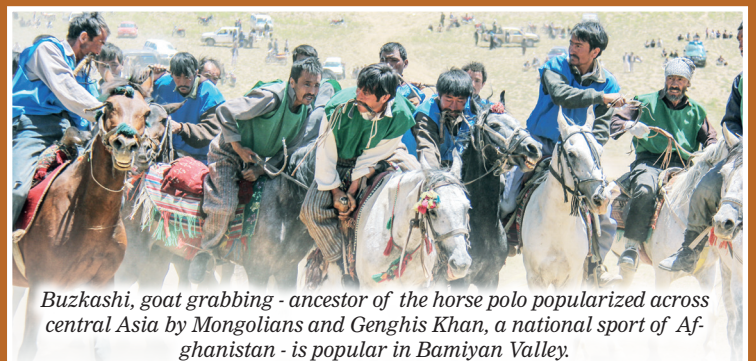
Buzkashi, goat grabbing - ancestor of the horse polo popularized across central Asia by Mongolians and Genghis Khan, a national sport of Afghanistan - is popular in Bamiyan Valley.