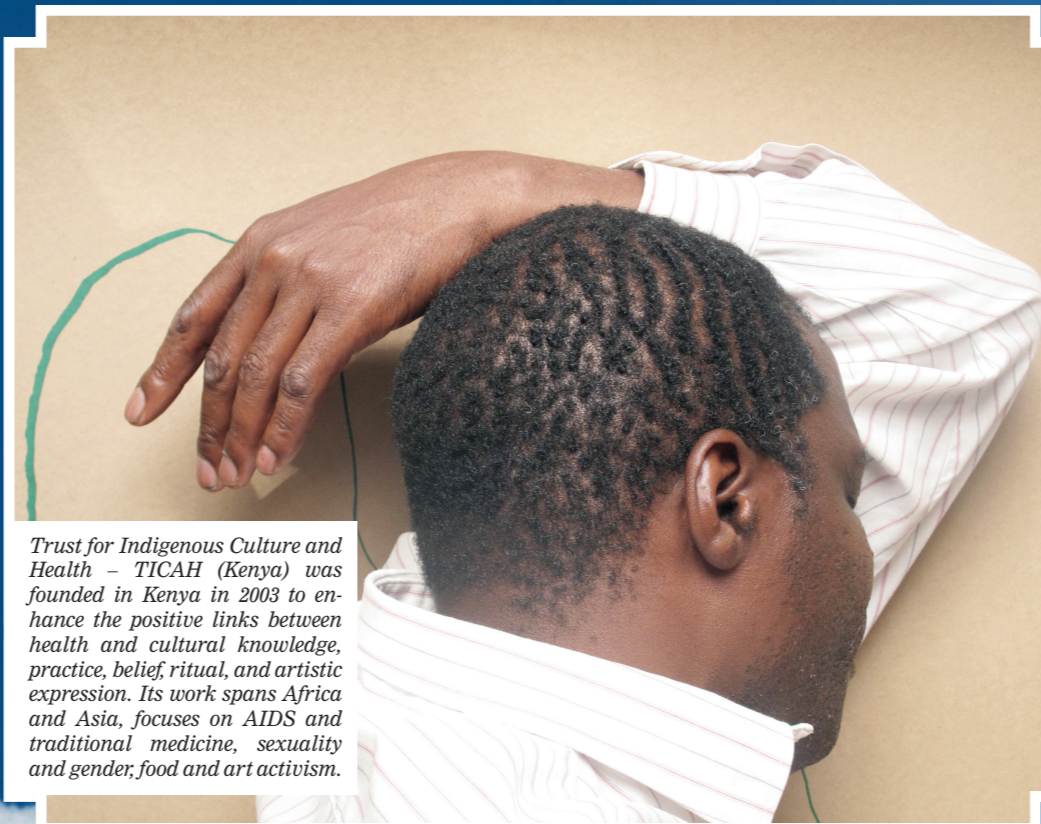
Trust for Indigenous Culture and Health - TICAH (Kenya) was founded in Kenya in 2003 to enhance the positive links between health and cultural knowledge, practice, belief, ritual, and artistic expression. Its work spans Africa and Asia, focuses on AIDS and traditional medicine, sexuality and gender, food and art activism.