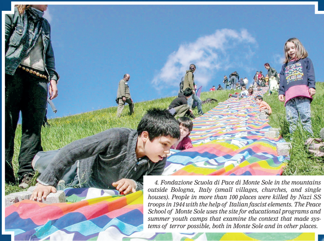
4. Fondazione Scuola di Pace di Monte Sole in the mountains outside Bologna, Italy (small villages, churches, and single houses). People in more than 100 places were killed by Nazi SS troops in 1944 with the help of Italian fascist elements. The Peace School of Monte Sole uses the site for educational programs and summer youth camps that examine the context that made systems of terror possible, both in Monte Sole and in other places.