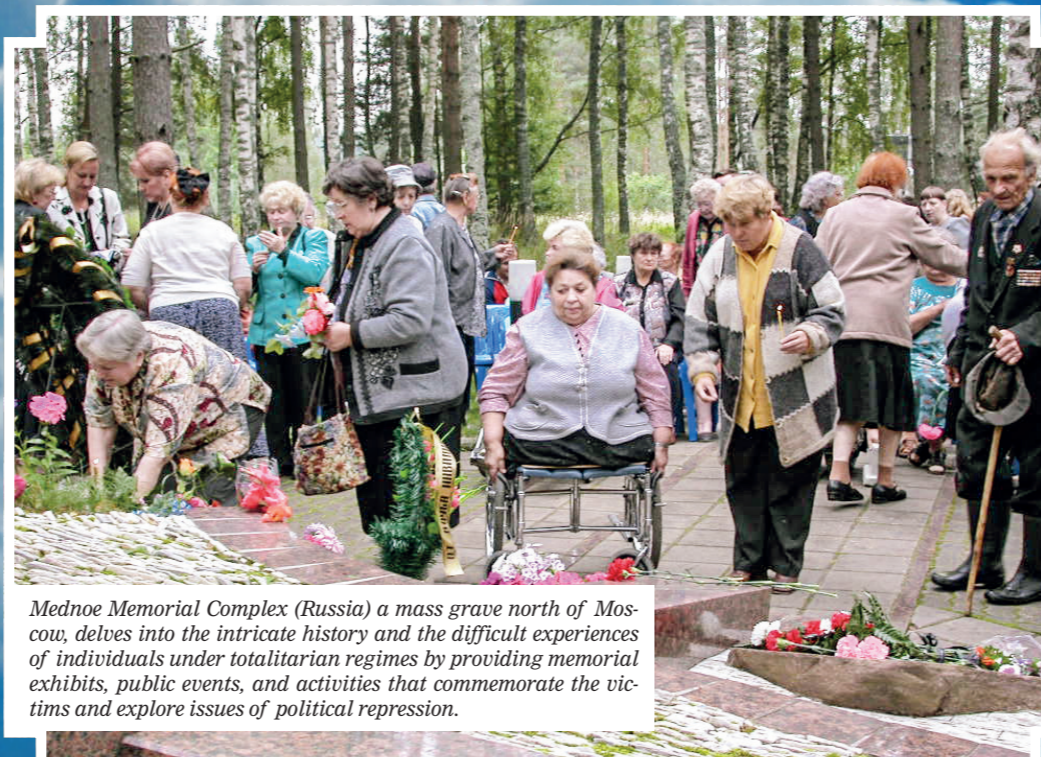
Mednoe Memorial Complex (Russia) a mass grave north of Moscow, delves into the intricate history and the difficult experiences of individuals under totalitarian regimes by providing memorial exhibits, public events, and activities that commemorate the victims and explore issues of political repression.

Nelson Mandela said that 'culture should be the language that should heal and transform the nation'. Mahatma Gandhi referred to culture as the 'authentic wisdom of human ends and means'. It is based on the wisdom derived from human suffering and the resilience of people from across the world that the International Coalition for Sites of Conscience promotes peace and justice.