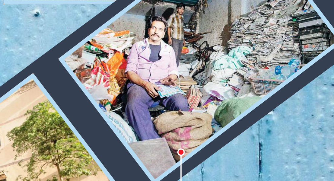
Recycling of paper and other discarded waste is a welcome business in any place, especially the World Heritage City.