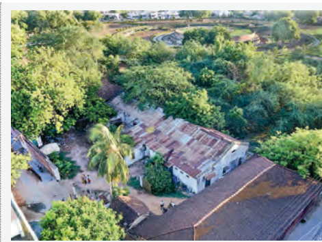
One of the oldest Ginning Mill remnants in Andhra are in Amaravathi next to the Maha Stupa. Guntur district is famous for the black cotton soils of the Deccan and cotton growing. It was also famous for weaving. Dhanyakataka was the heart of the lower River Krishna Valley and its historical evolution through intensification of agriculture and growth of commerce in the Indo Roman trade. More than two thousand years ago, it was attributed by the Greco Romans as the source of finest cottons in the then known world. No wonder one of the very early ginning mills under the British was established here. Its history is tied up with exploitative colonial taxation and impoverishment of weavers. It is also connected with the subsequent Swadeshi movement under Mahatma Gandhi. Appropriate protective measures are needed to safeguard such historical heritage that is neglected or destroyed.