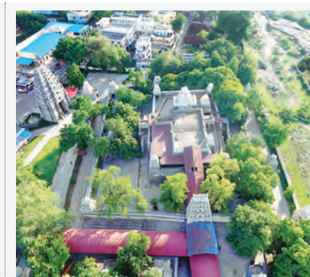
The main temple of Amaralingeswara Swamy evidences more than a thousand years of history. It was restored in time for the Pushkaralu in 2016 under the PRASAD Scheme of the Central Government by the APTDC and Endowments together under the supervision of the Amaravathi Heritage Centre and Museum. It is the first systematic restoration of a temple in AP and with quality elements ensured across the temple precincts it sets new standards for the maintenance of temples in the state. Good conservation is good business even in places of worship - the temple's income has trebled after the interventions. According to the MRO the temple brings more than 90% of visitors to Amaravathi contributing to local economy and job creation.

sation of such legacies and postcolonial understandings are slow to emerge in several Indian states. Hopefully the new state of Andhra and the new Board of Tourism, Culture and Heritage can make a difference and perhaps even lead the way. Only time will tell.