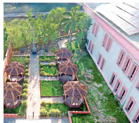
On the occasion of the Kalachakra Ceremony, His Holiness the Dalai Lama planted a Bodhi tree sapling from Bodhi Gaya attributed to the original Bodhi Tree. Soon after the Kalachakra the sapling was abandoned, and the area used as a car park and public amenity. One of the first interventions of the Amaravathi Heritage Centre and Museum was to revitalize the sapling that is now a tree, commission ashtanga symbolism through eight granite stones sourced through carvers from Duggi, a granite Dharma Chakra, five Gazeboes symbolic of the five disciples when Buddha turned the wheel of Dharma and a bamboo plantation representing Venu Vanam. It is the first project of museum intervention to promote the basic notion of respect for heritage values and places to both locals and visitors.