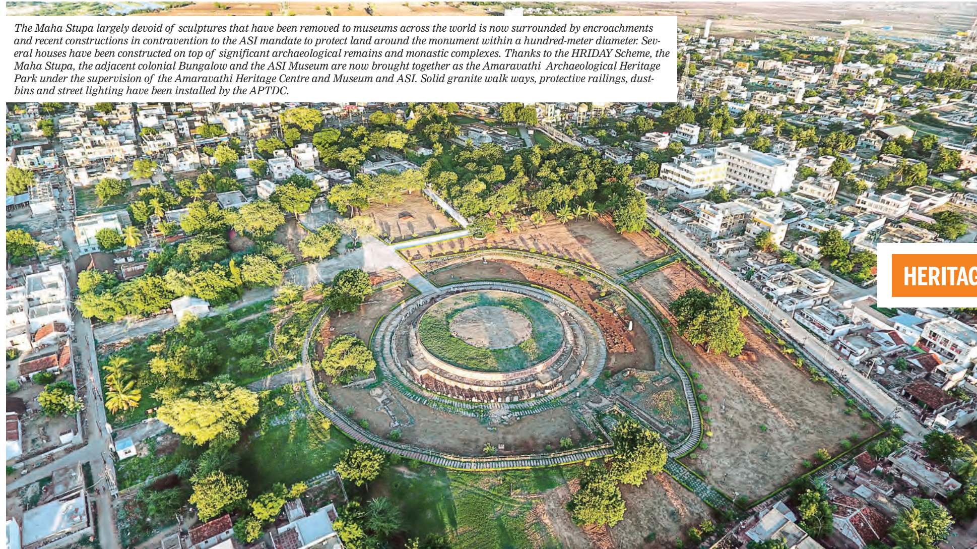
The Maha Stupa largely devoid of sculptures that have been removed to museums across the world is now surrounded by encroachments and recent constructions in contravention to the ASI mandate to protect land around the monument within a hundred-meter diameter. Several houses have been constructed on top of significant archaeological remains and monastic complexes. Thanks to the HRIDAY Scheme, the Maha Stupa, the adjacent colonial Bungalow and the ASI Museum are now brought together as the Amaravathi Archaeological Heritage Park under the supervision of the Amaravathi Heritage Centre and Museum and ASI. Solid granite walk ways, protective railings, dustbins and street lighting have been installed by the APTDC.