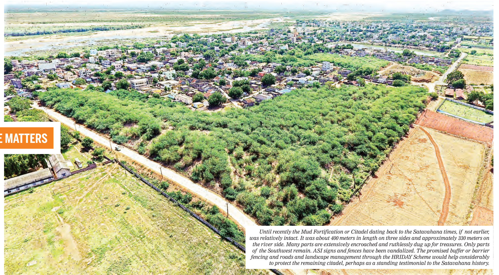
Until recently the Mud Fortification or Citadel dating back to the Satavahana times, if not earlier, was relatively intact. It was about 400 meters in length on three sides and approximately 330 meters on the river side. Many parts are extensively encroached and ruthlessly dug up for treasures. Only parts of the Southwest remain. ASI signs and fences have been vandalized. The promised buffer or barrier fencing and roads and landscape management through the HRIDAY Scheme would help considerably to protect the remaining citadel, perhaps as a standing testimonial to the Satavahana history.