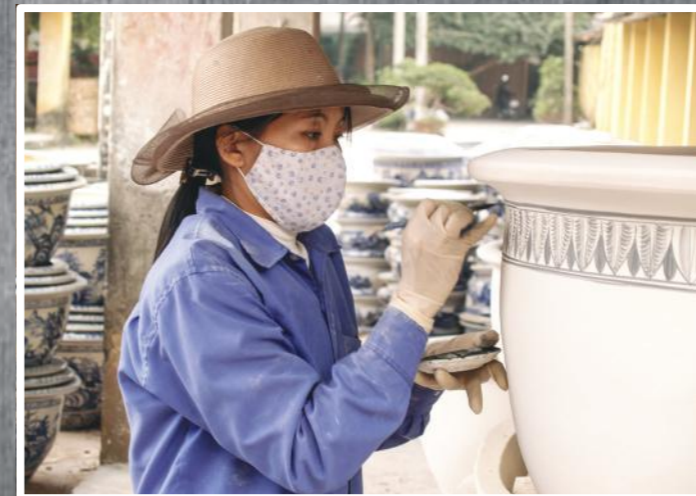
Dang Trieu, Quang Ninh Province in Vietnam, was one of the poorest villages in which I worked anywhere in the world. We used Ecomuseology as a methodology to revitalize the great late medieval ceramic heritage of the village through Public Private Partnerships. It is now one of the most livable villages in Vietnam with an annual turnover of over $ 7 million. Women are the artists in both the traditional and contemporary design and other plastic arts. Men are the potters.