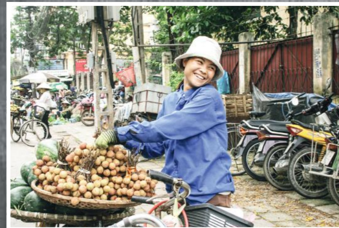
Vietnam Women's Museum has permanent displays on the history and heritage of women and their families. It has vibrant exhibition projects with stakeholder community groups. When the Hanoi Administration tried to ban street vendors endangering the livelihoods of women and their families, and the quintessential Hanoi tourist experience, the Museum's exhibition on Street Vendors resulted in the government reversing its decision. Museum used its heritage collections from the past and stories from the present to advocate social justice.

Vietnam takes the policy position that gender equity is not oppositional between men and women, but rather a space for sharing authority power and quality of life. Nations should use laws to expand the life choices and human capacity of their people. We need to unleash the creative agency of women who can contribute substantially to every aspect of social progress. Vietnam